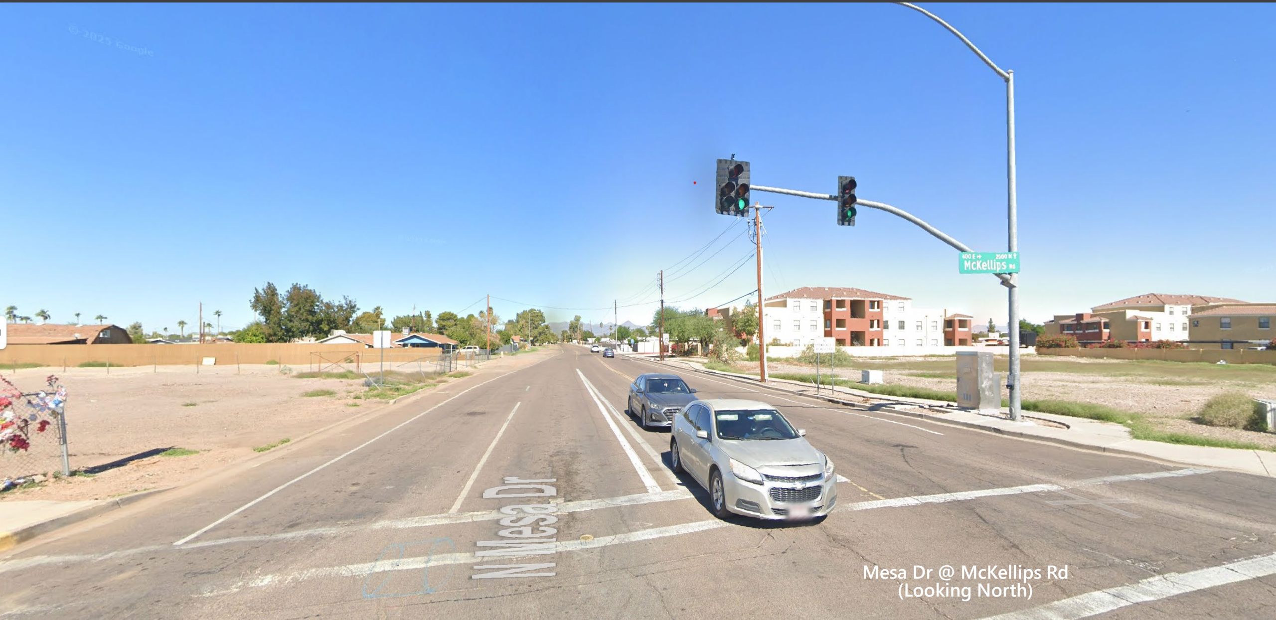
Mesa Dr @ McKellips Rd (Looking North)