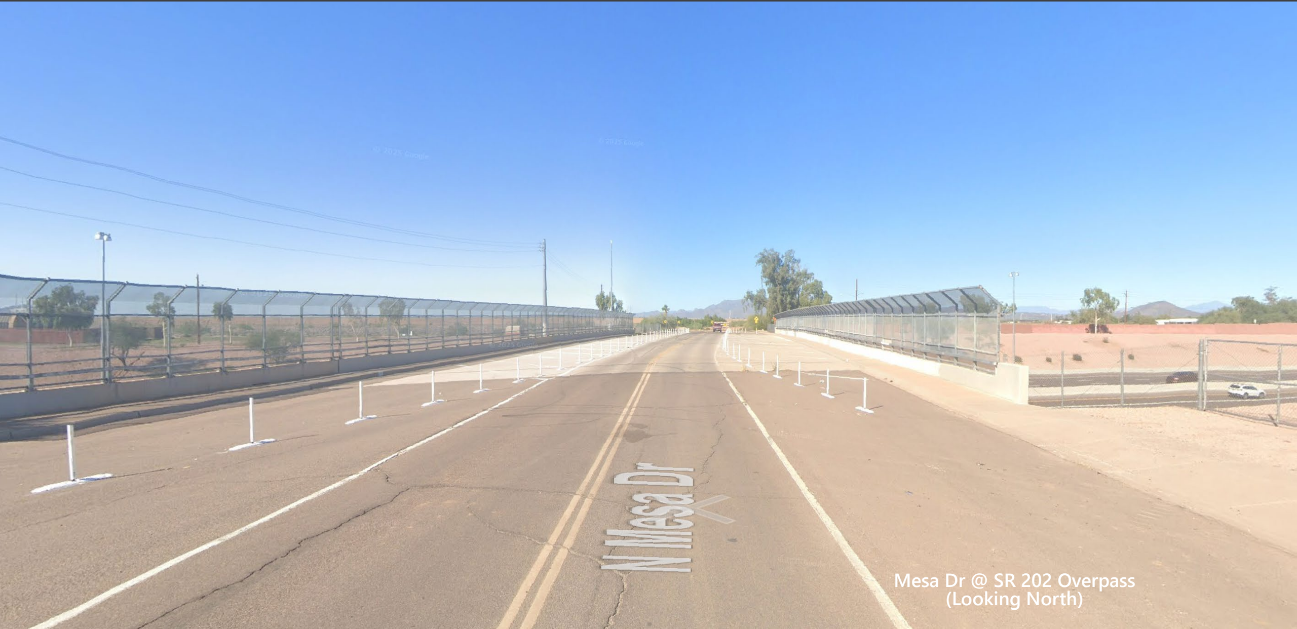
Mesa Dr @ SR 202 Overpass (Looking North)