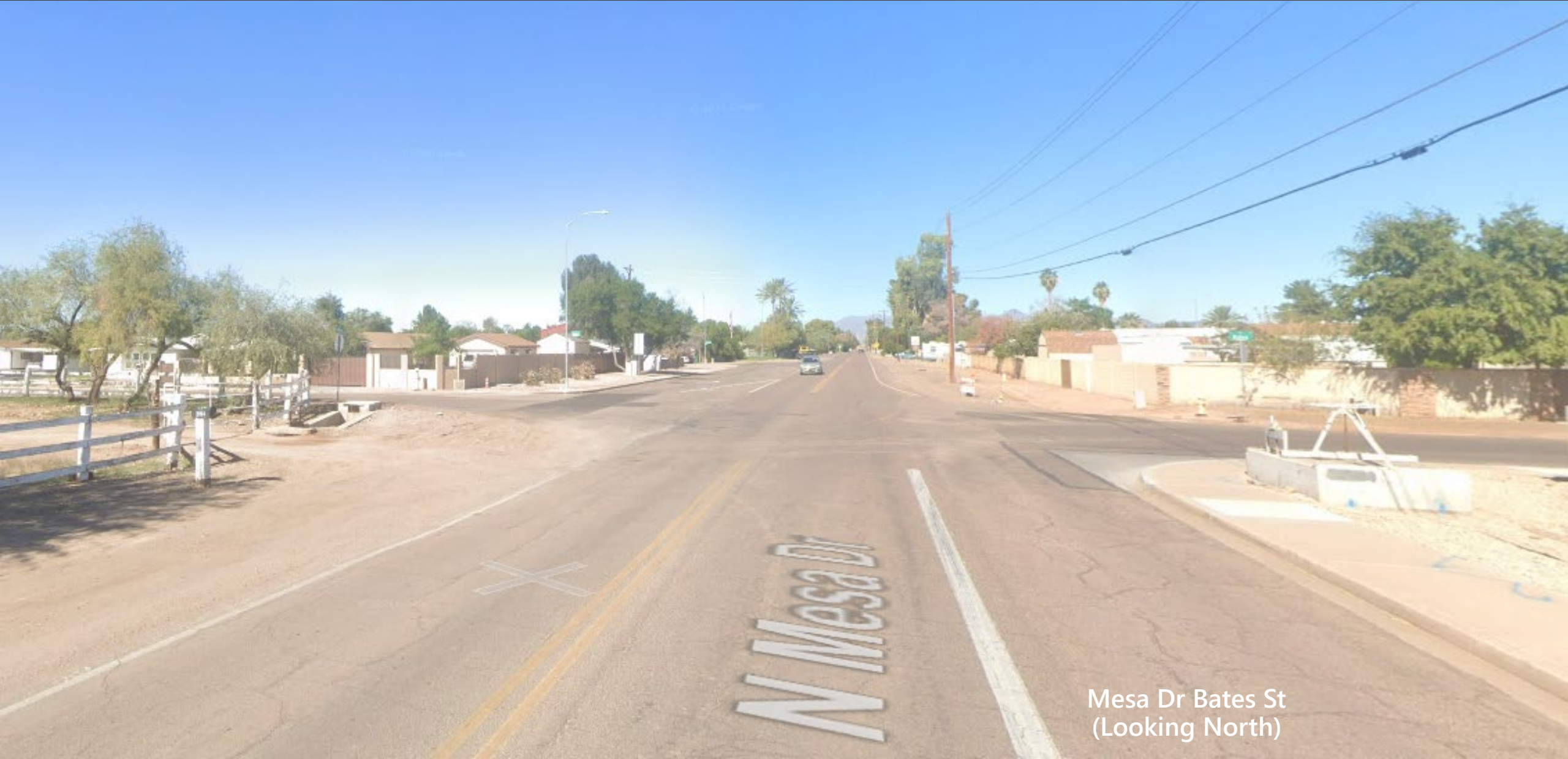
Mesa Dr Bates St (Looking North)